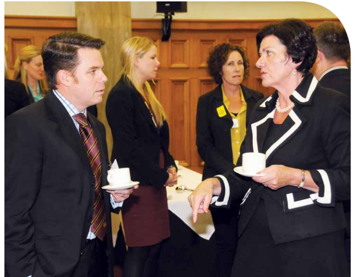
Honourable Anne Tolley, Minister of Police and Minister of Corrections

"It was incredibly interesting. I was unaware as to the amount of joint/group across party decision making."