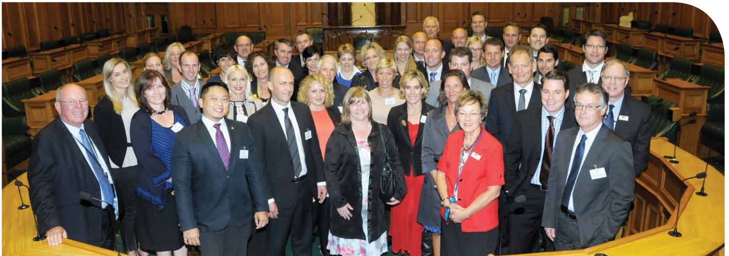
Attendees of the March Parliamentary Seminar

"The seminar has been extremely informative and well structured. I walk out today with a wealth of knowledge about Parliament, its people, structure and culture. Thank you!"